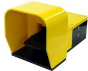
Variable speed foot pedal