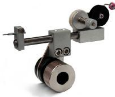
Guide tube feeder head