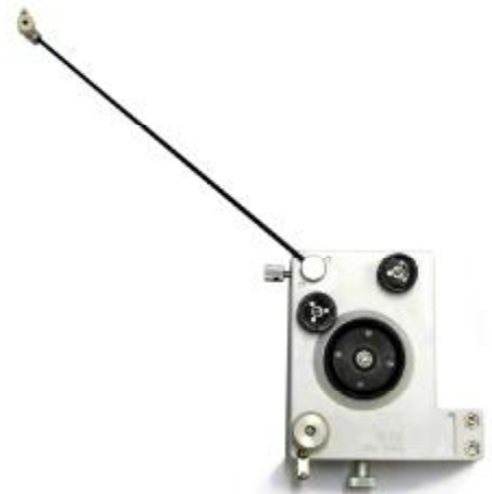
Type "A" or "B" tensioner

We aim to be much more than a machinery supplier. Our team has a vast range of winding experience and is able to offer help and advice on all aspects of coil winding, from tooling design to machine choice and set-up.