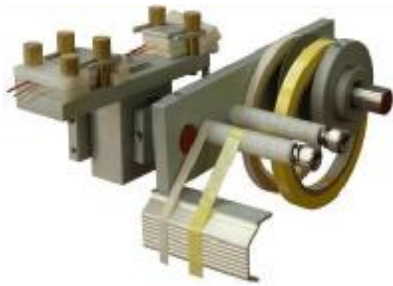
Multi-wire feeder head with margin taping