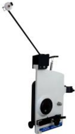
F71 fine wire tensioner